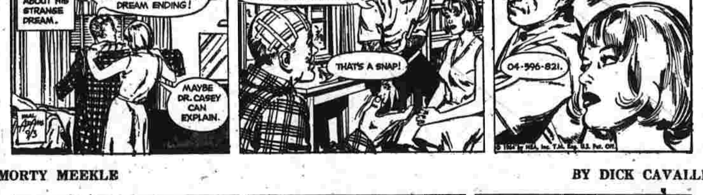
MORTY MEEKE BY DICK CAVALLI