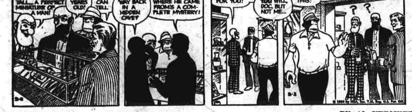
FRISCALLA'S POP BY AL VERMEER